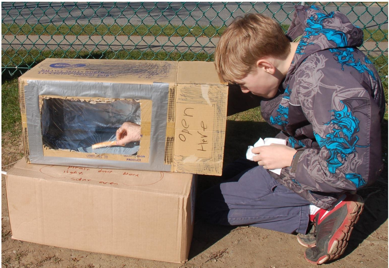
Photo: Sam (Safe Base) used cardboard, tin foil, clear plastic wrap and tape to make a solar oven. The clouds parted long enough to heat goldfish crackers but there wasn't enough energy for the cheese stick to melt. There are plans to try again when he is able to “switch on” summer.

How much do we “dig” the warm weather? Two shovels up for the sandbox! Some enthusiasts are already asking how many sleeps until we have another beach bucket brigade. Spanish Banks at low tide is the real sandbox of choice.