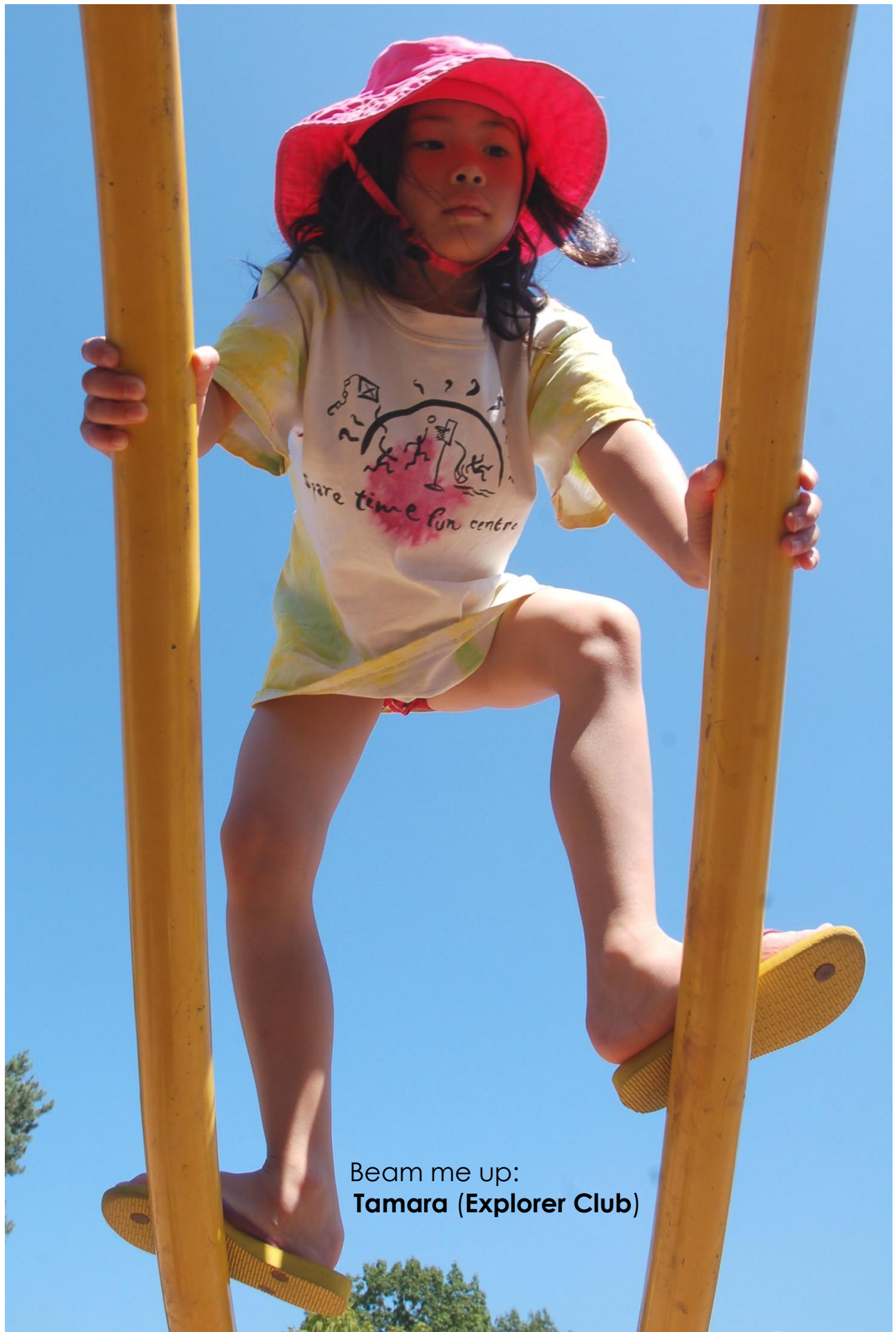
Beam me up: Tamara (Explorer Club)