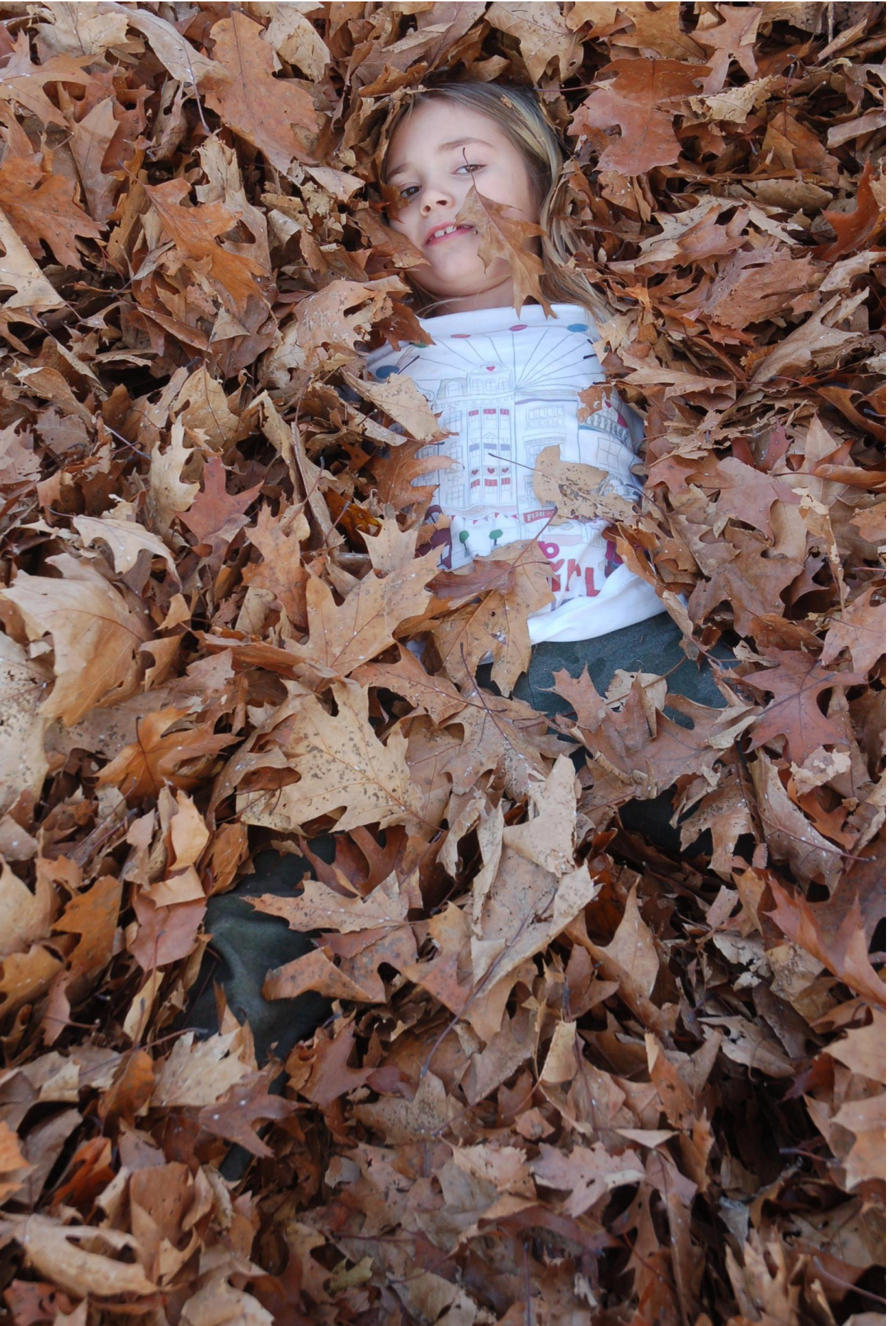
Rake and relax: Sierra (Adventure Club)