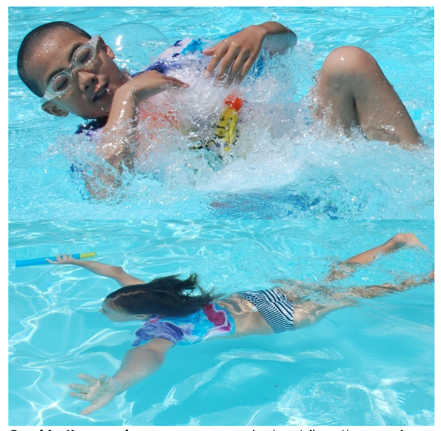
Cool in the pool means some splash while others swim By Fred (Adventure Club)

I like to play "tidal wave" in a pool with my friend Karl. It involves splashing and surfing. I use my hands to make big waves. I also like to do water guns.