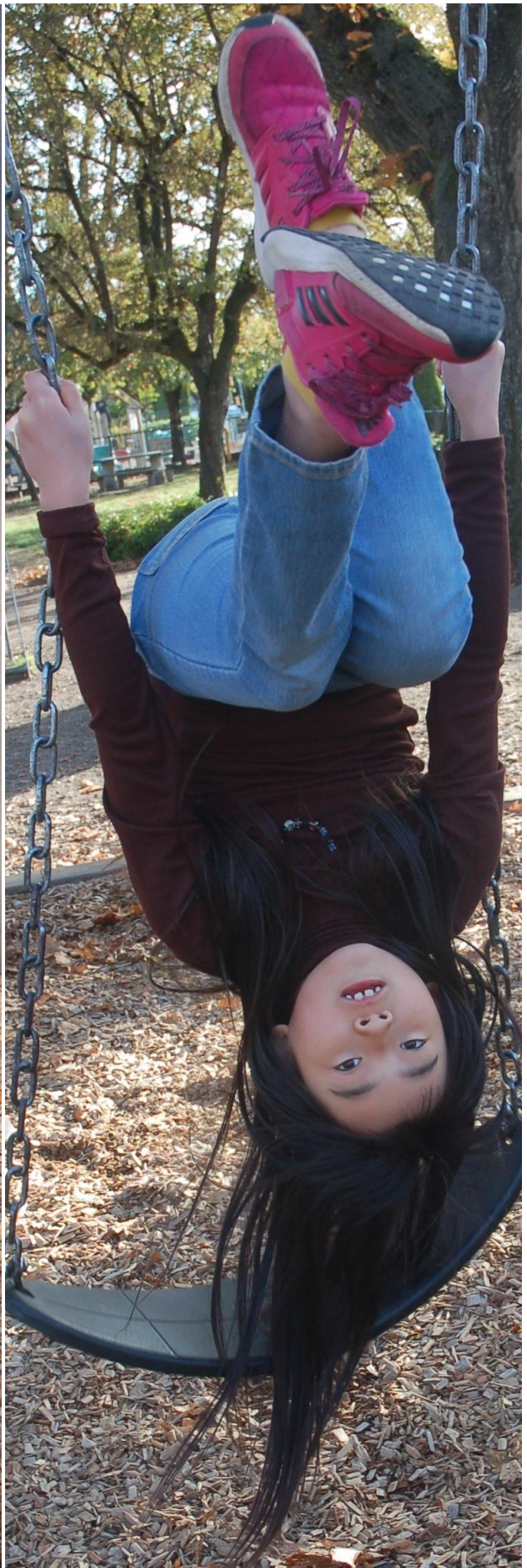
Jode (Discovery Club) and “twin” practise playground gymnastics.